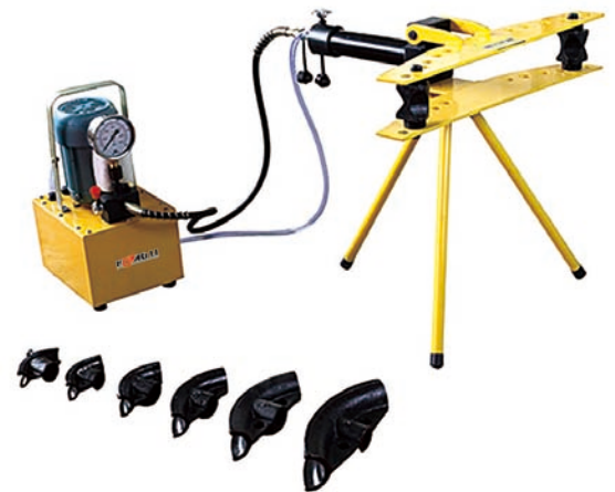
optional tripod stand